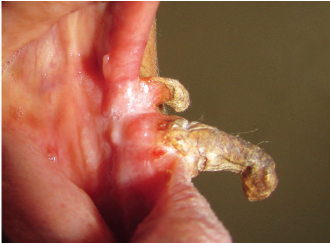
Fig. 2: The surface appeared blackened, rough, and hairs were noticed in its surface