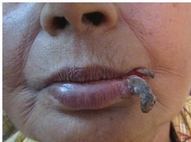
Fig. 1: Two horn-like projections in the lower lip

On examination, two horn-like projections of keratinized tissue were seen in the left lip commissure parallel to each other (Fig. 1). The horn that was seen in the above inset in Figure 1 was 1 cm in length and the one below was larger and 3 cm in length. The surface appeared rough and blackened, and hairs were noticed on their surface (Fig. 2). The base was sessile and hyperkeratotic and the surrounding mucosa posterior to the horns appeared proliferated. A diffuse white patch was noted extending posteriorly from the commissure of the lip to the buccal mucosa and inferiorly toward the corresponding buccal vestibule.