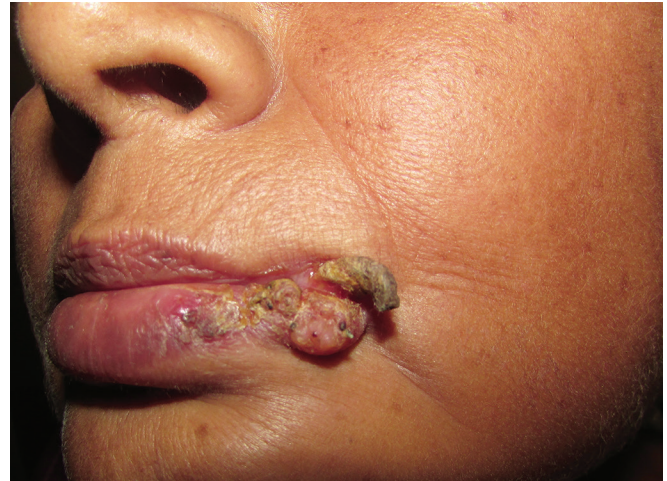
Fig. 3: Cutaneous horn exfoliated on its own without provocation