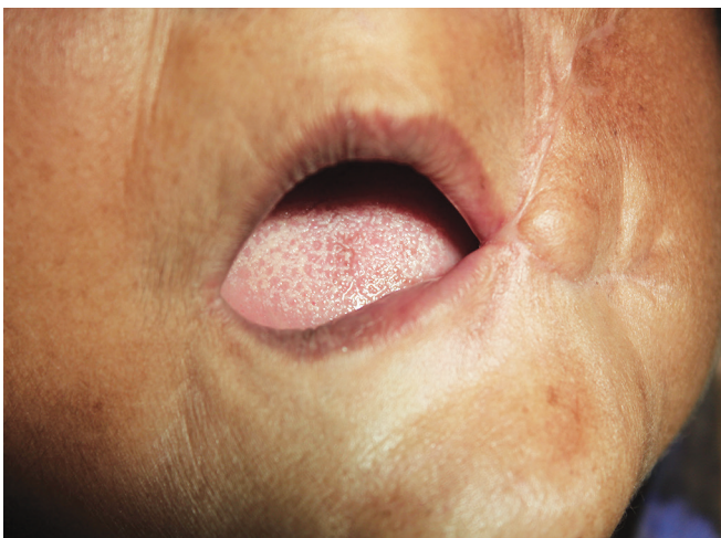
Fig. 4: Postoperative photograph

On palpation, the lesion was nontender and indurated. A provisional diagnosis of a cutaneous horn with underlying carcinoma of the left buccal mucosa was given.