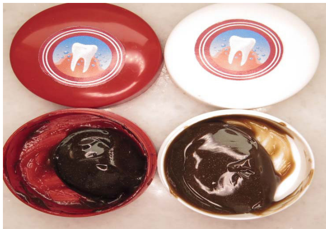
Fig 1 Placebo and original gel

The measurement obtained was interpreted and subjected to statistical analysis. Reproducibility was assessed by evaluating agreement between two independent surgeons using the weighted Kappa statistic. The allocation of the participants were prepared from the independent person using the MinimPy Software for sequential allocation of subjects to treatment groups in clinical trials by using the method of minimization.